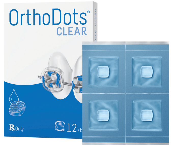
Hygienically packaged in single-use applications