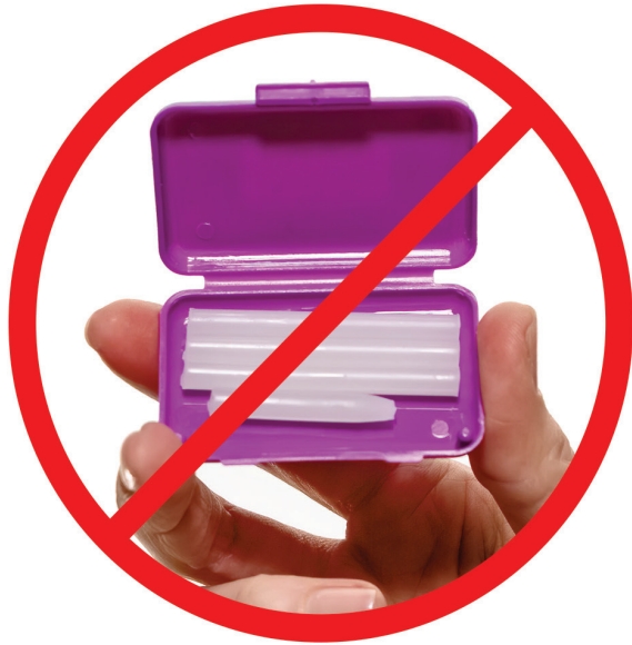
Contaminated when handled repeatedly